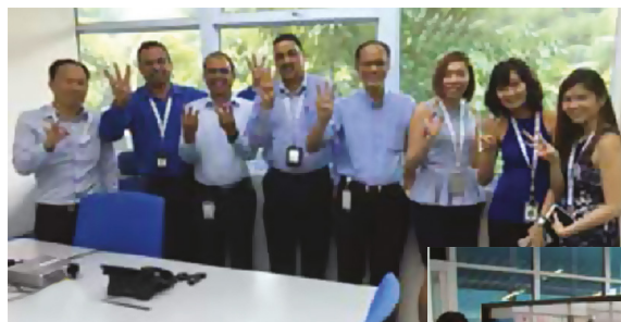
The team in our Singapore office, wearing blue for Water Week

Externally, we will continue to support our clients to assess and manage business water risks. This is where Amec Foster Wheeler can make the biggest positive impact through our water experts within the business. Specific information on our water services and projects can be found at amecfw.com/water .