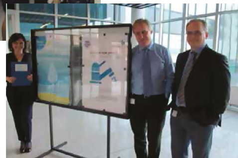
Our colleagues in the Milan office, celebrating Water Week