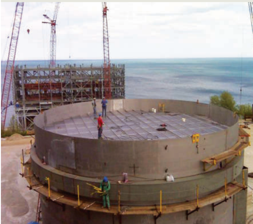
The DFT can be used as a staging platform during construction.